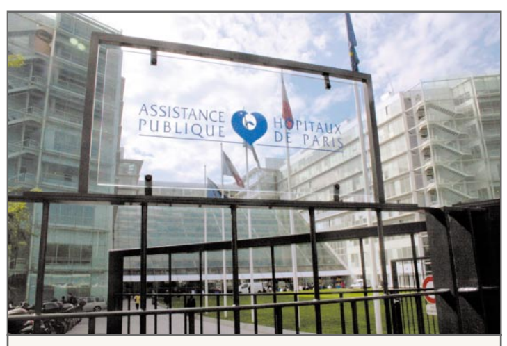
Pompidou Hospital, Paris, 2004.

measures in France have come from the political left or right, French politicians have defended their health care system as an ideal synthesis of solidarity, liberalism, and pluralism.